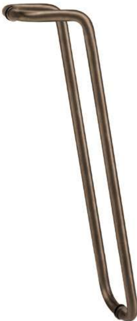
Pictured: right-hand model, outside view