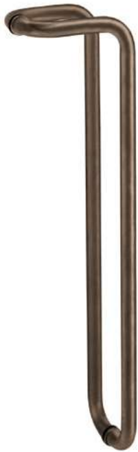
Pictured: right-hand model, outside view